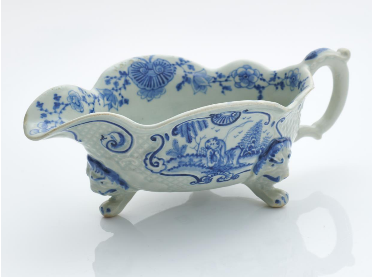
Limehouse sauceboat, c. 1746-48, Private Collection