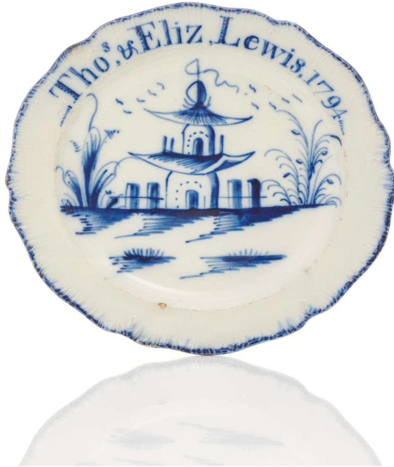
A Swansea pearlware plate, shell edged, inscribed Tho's & Eliz Lewis, 1794 Photo © Sylvain Deleu, Private Collection